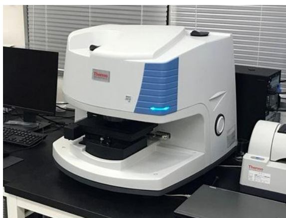
Micro-FT-IR : Nicolet iN10MX (Thermo Fisher Scientific)