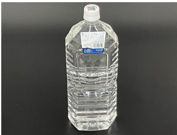
Bottled Water in PET Bottle (1,954mL)