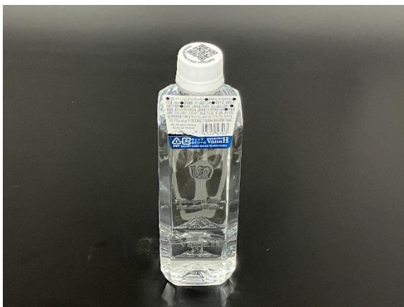
Bottled Water in PET Bottle (520 mL)